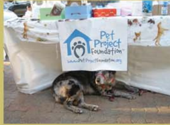
Top: Three PPF volunteers with two graduates of the San Clemente–Dana Point Shelter. Bottom: Graduate of shelter resting at craft faire while owner works.

"The Art Fair has enabled PPF to bring in needed funds for shelter animals, particularly to help with our growing medical expenses," Kazoleas said. "But almost more importantly, our participation has allowed us to share with the community information on what we do, and bring much needed attention to the dogs, cats and bunnies that are looking for loving homes."